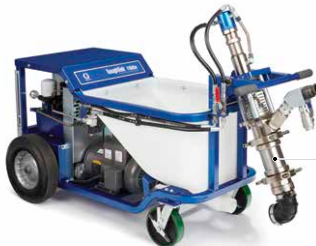
Pivoting Pump Lower