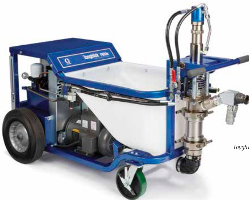
ToughTek F680e Fireproofing Pump

The ToughTek Fireproofing Pump's durable piston pump stands up to highly abrasive fireproofing materials. Its quick knockdown design makes maintenance fast and easy. You eliminate the frequent expense of replacing pump parts.