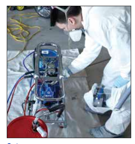
Set - Get ready to spray in a matter of minutes.