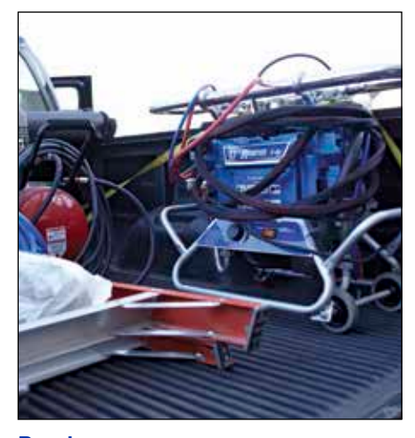
Ready - Easy to transport to the job site.

* Per The Dow Chemical Company for Froth Kits: The theoretical yield has become an industry standard for identifying certain sizes of two-component kits. Theoretical yield calculations are done in perfect laboratory conditions, without taking into account the loss of blowing agent or the variation in application methods and types. This chart is an example only and should be reviewed for each application. Dollar savings are not guaranteed. Actual results may vary.