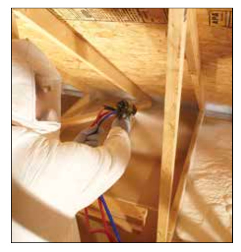
Spray - Ideal for attics and rim joists.